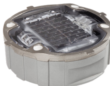
Version with synchronized flashing