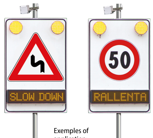
Exemples of application: Safety Radar