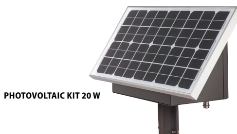
PHOTOVOLTAIC KIT 20 W