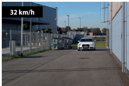
02.03.2016 - 11:03:29 / +1000ms - image-sequence 1/3 - detected speed = 32km/h Location: Parcheggio 1 - I-25086 Rezzato - ID = 5678