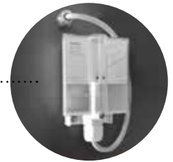
Antenna for Time Box Pro